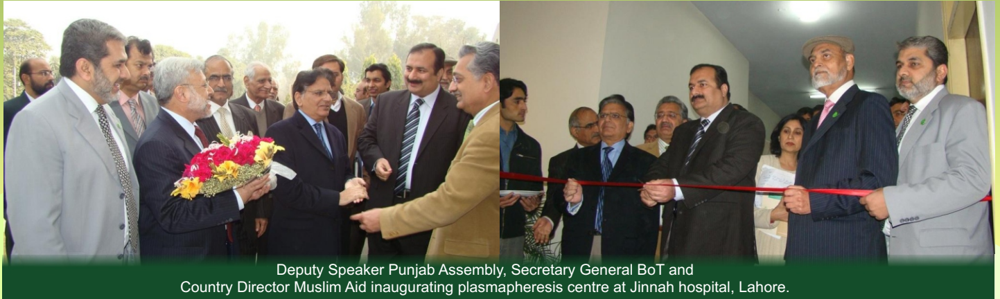
Deputy Speaker Punjab Assembly, Secretary General BoT and Country Director Muslim Aid inaugurating plasmapheresis centre at Jinnah hospital, Lahore.